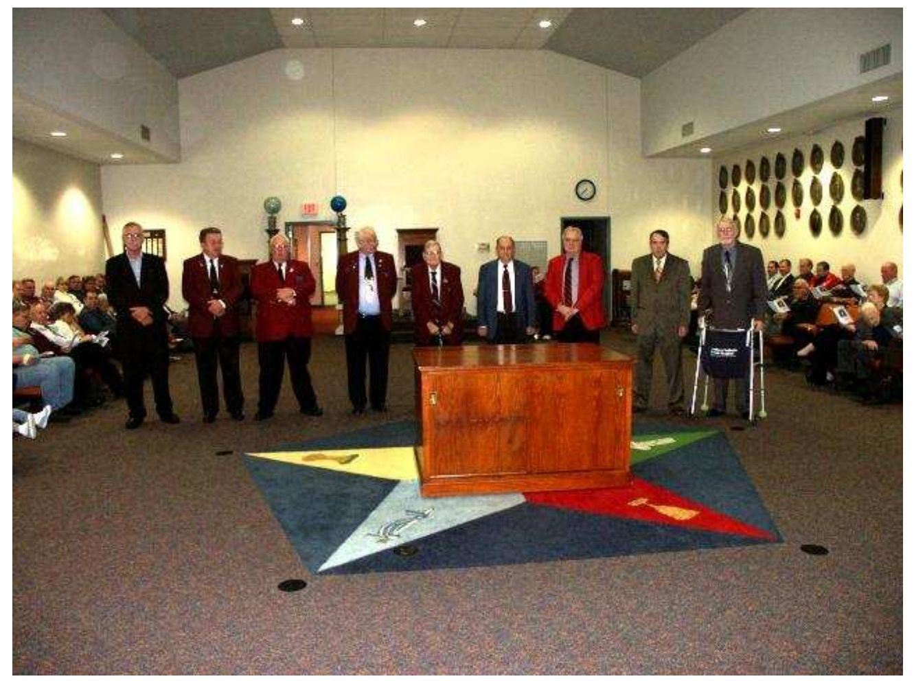
Past Masters' Night, October 30th, 2008.