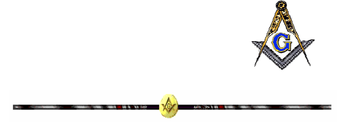
(Continued from page 4)

A big Thank You, Carl, for being so faithful to your Lodge. It shows that even busy people have time to have fellowship with their Lodge brothers.