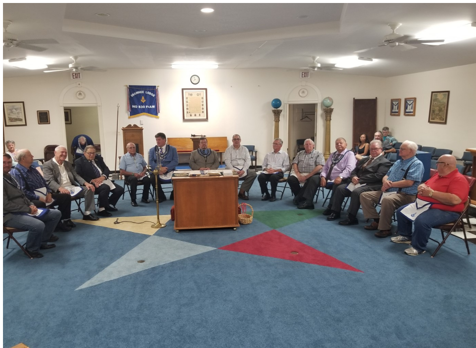
OUR 2018 GROUP OF PAST MASTERS.