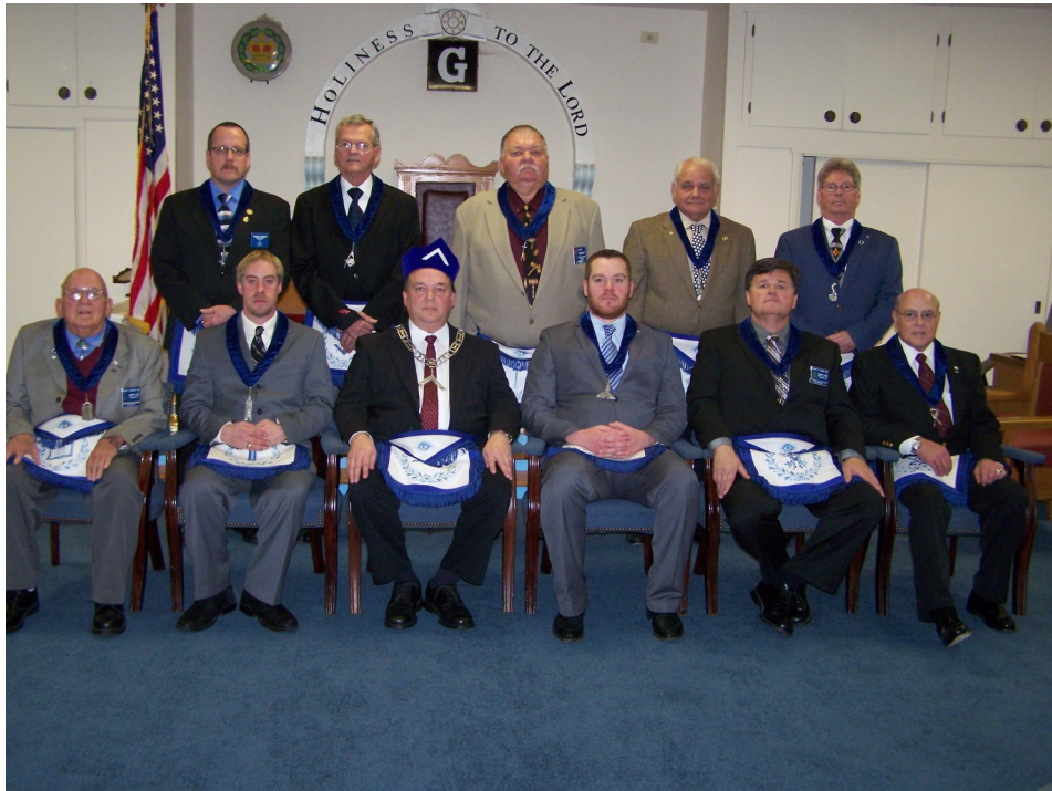
Officers in 2014 top Masonic stone bottom