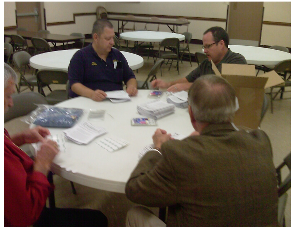
SHAWNEE BROTHERS LABELING THE SHAWNEE LIGHT