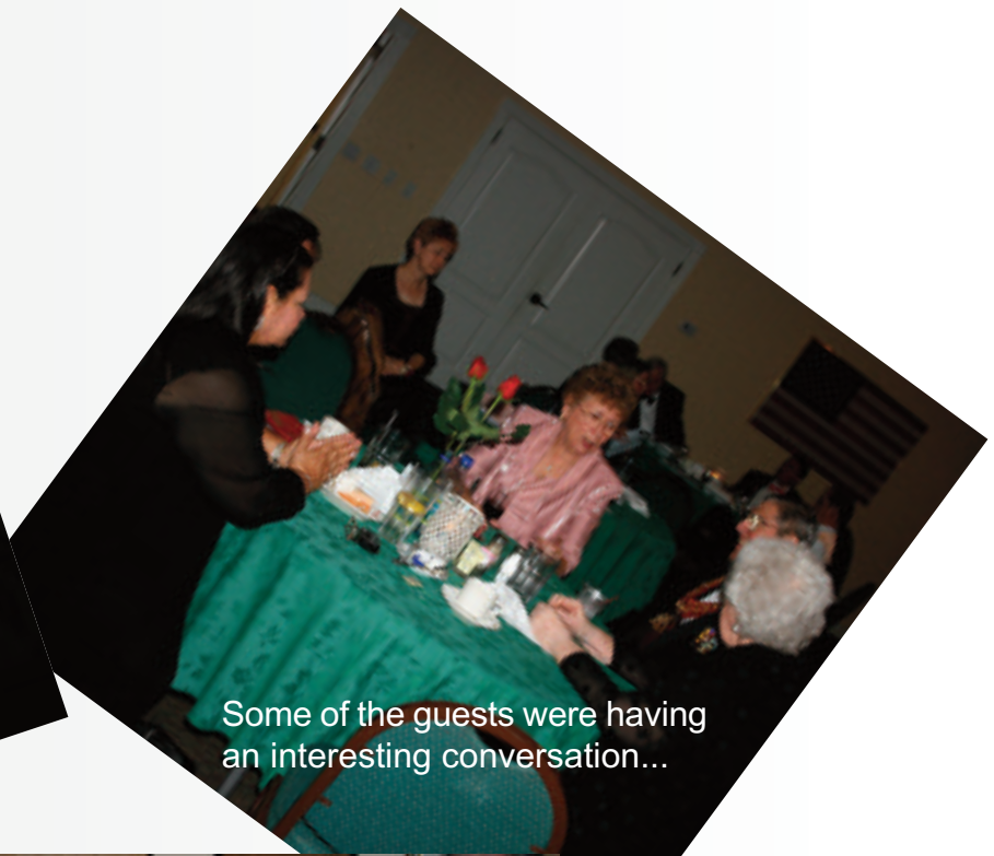
Some of the guests were having an interesting conversation...