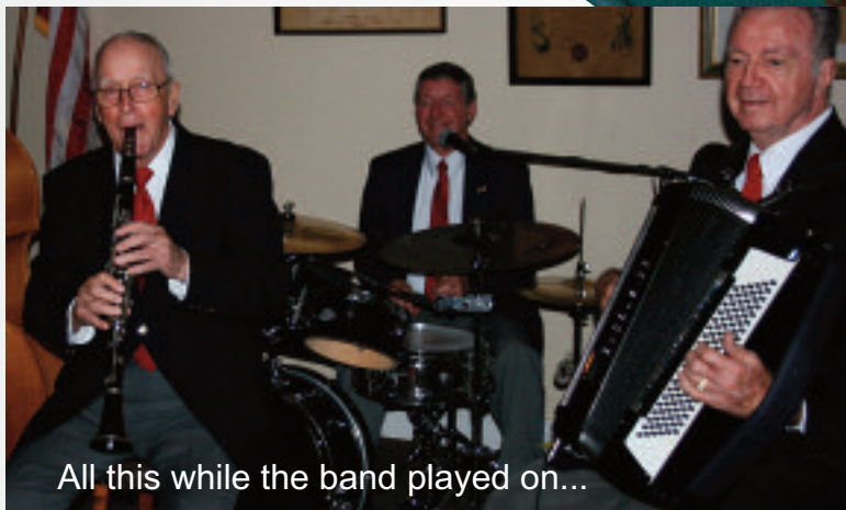
All this while the band played on...