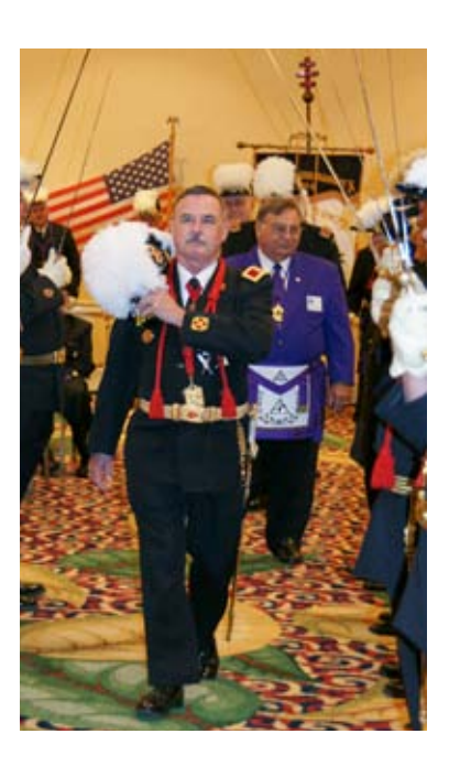
Reception of dignitaries of other Jurisdictions and Masonic Bodies. Includes the General Grand Chapter, General Grand Council International and the Florida Grand Lodge