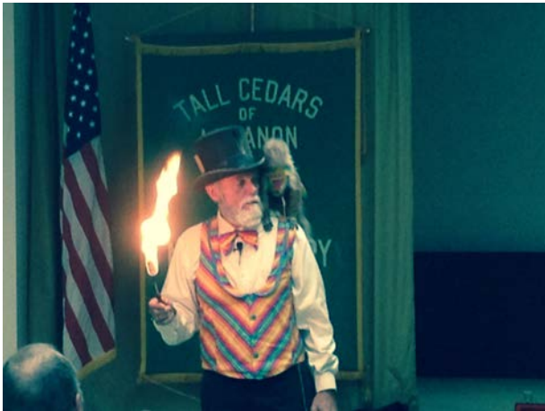
Open House and The Monkey Man