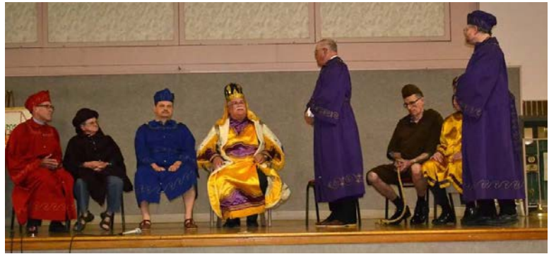
Baltimore Forest Prologue and Royal Court