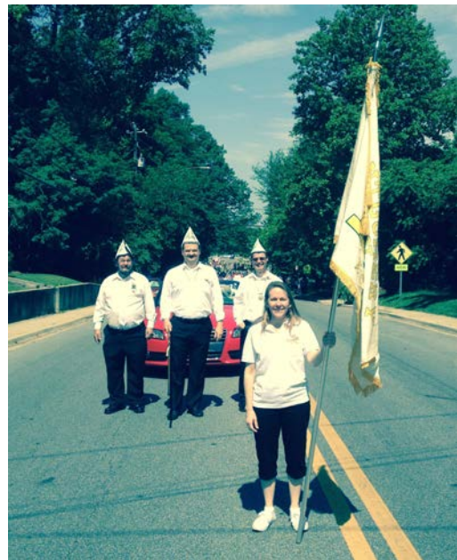
Memorial Day Parade - Rockville