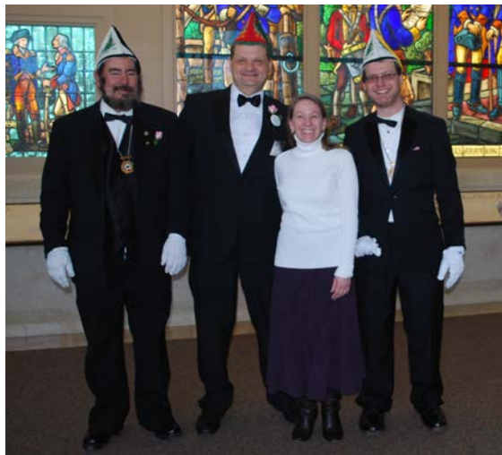
Wreath Laying at Bro. George Washington's Tomb @ Mt. Vernon