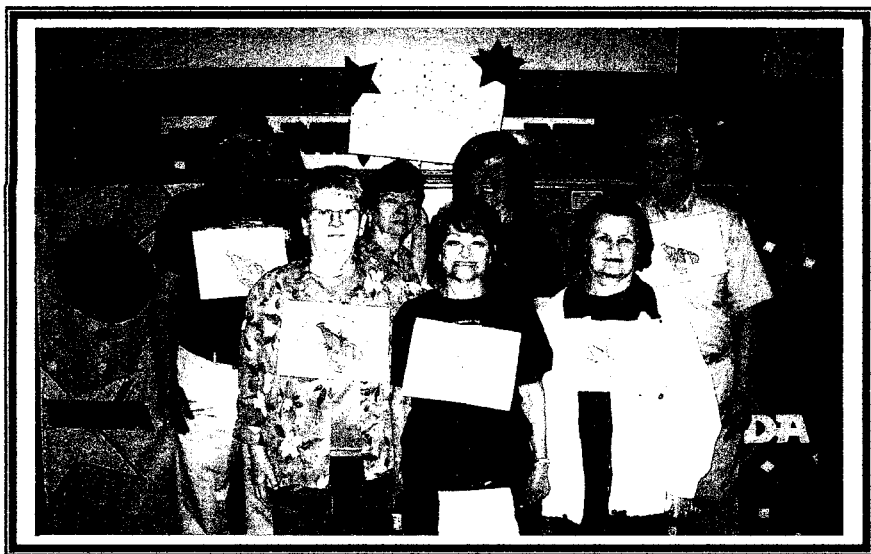
Remember these Guys ?