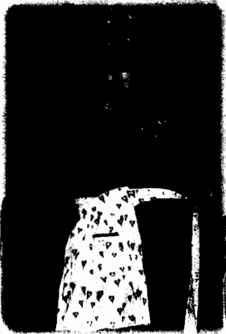
Apron Salesman at last Shrimp Feast

October was our Fall Festival Train Ride in Walkersville, MD . The date was the 13 th , but I have a conflict and there are no other dates that are available, so I am going to cancel the train ride . Maybe Next Year if the Grand Tall wants to do it.