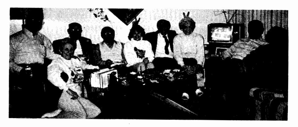
PARTIES ARE WELL ATTENDED