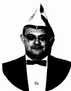
J. D. G. T. C.

We all know that a Tall Cedar must first be a Mason and we all have our cards to prove it, but do we attend our Blue Lodge? Work and live or at least attempt to work and live our lives according to our fraternal teachings. Do you by chance take an active part in Masonry either in the line, supporting blue lodge functions, assisting in helping the youth organizations of the Lodge, backing the Worshipful Master of your Lodge in his fraternal duties both in and out of the meetings themselves? Brother, if the answer to the above is "Yes" we can then say we have the qualifications of a Tall Cedar - but being a Tall Cedar then puts another task upon you.