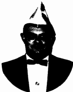
J. D. G. T. C.