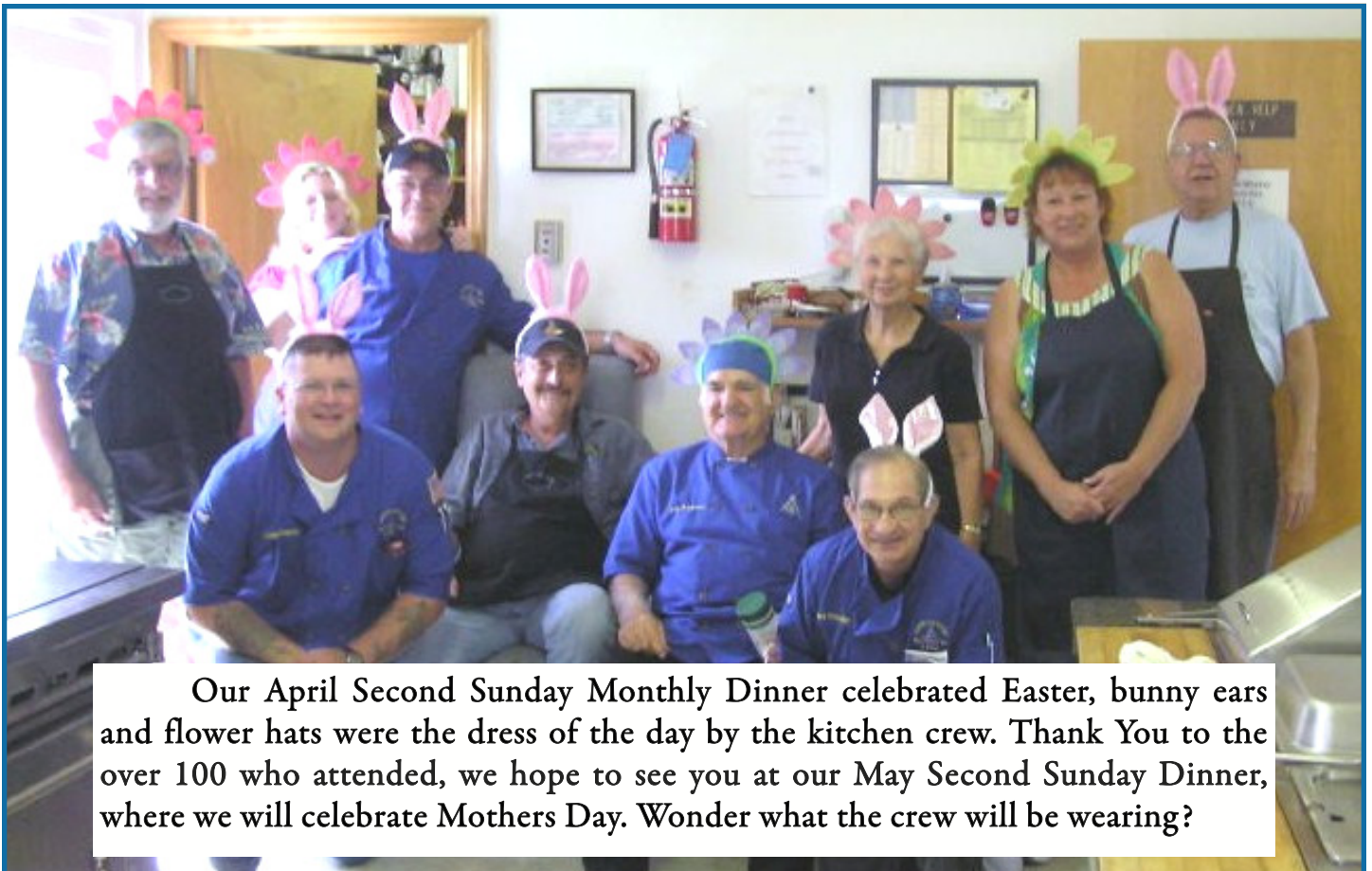
Our April Second Sunday Monthly Dinner celebrated Easter, bunny ears and flower hats were the dress of the day by the kitchen crew. Thank You to the over 100 who attended, we hope to see you at our May Second Sunday Dinner, where we will celebrate Mothers Day. Wonder what the crew will be wearing?