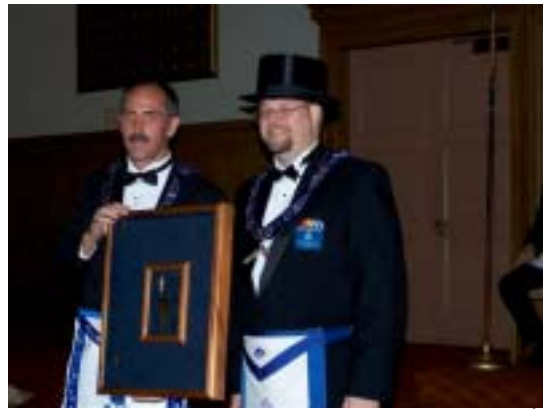
Honolulu Lodge Installation on December 4<sup>th</sup>, 2004 at Scottish Rite Cathedral