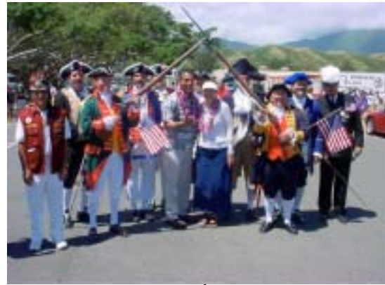
Kailua Parade, July 4 th , 2004