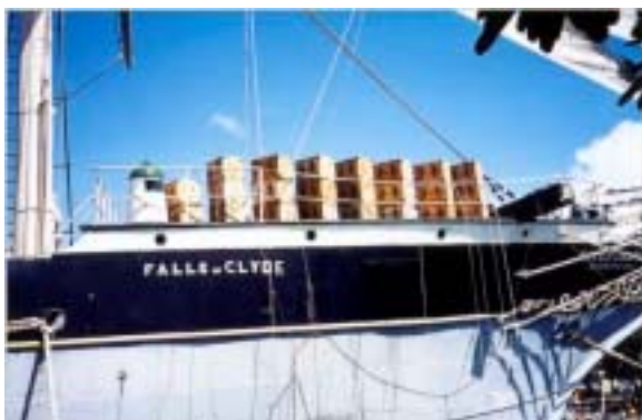
Falls of Clyde, Hawaii Maritime Center