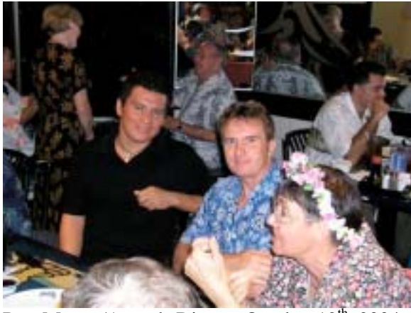
Past Master/Awards Dinner, October 12 th , 2004