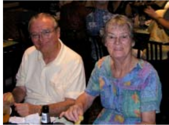
Past Master/Awards Dinner, October 12 th , 2004