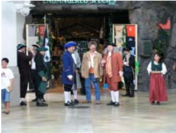
Boston Tea Party, September 11 th , 2004