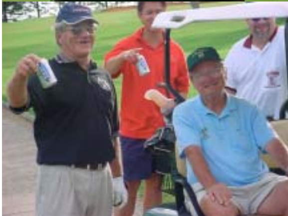
Shriners Golf Tournament, July 2004