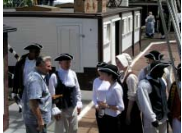
Boston Tea Party, September 11 th , 2004