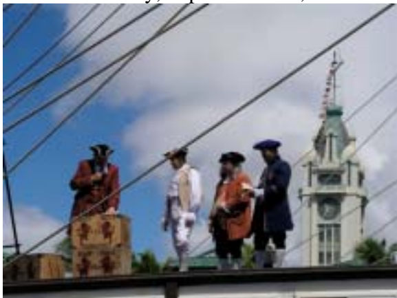
Boston Tea Party, September 11 th , 2004