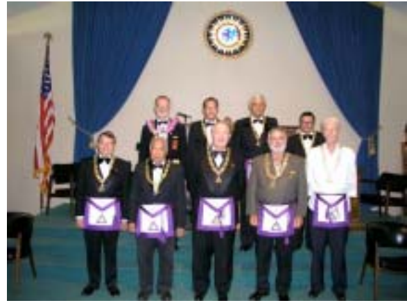
York Rite Grand Chapter and Council Installation