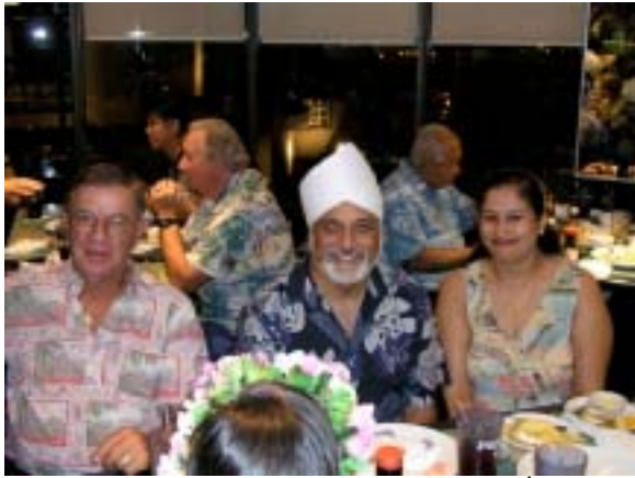
Past Master/Awards Dinner, October 12 th , 2004