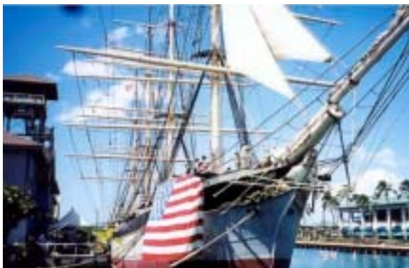
Falls of Clyde, Hawaii Maritime Center