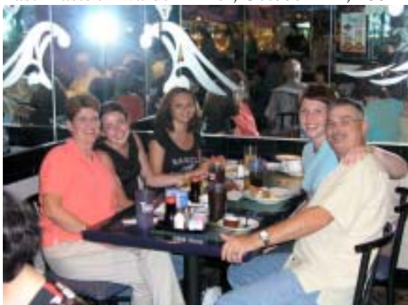
Past Master/Awards Dinner, October 12 th , 2004