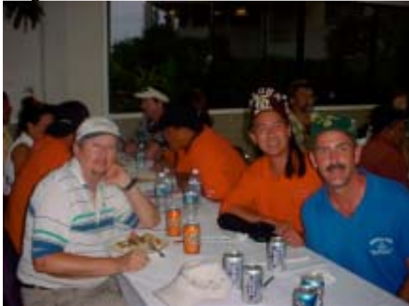
Honolulu Lodge Team, Shriners Golf Tournament, July 2004