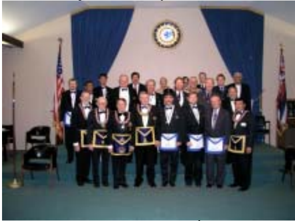
Grand Lodge Visit, August 3 rd , 2004