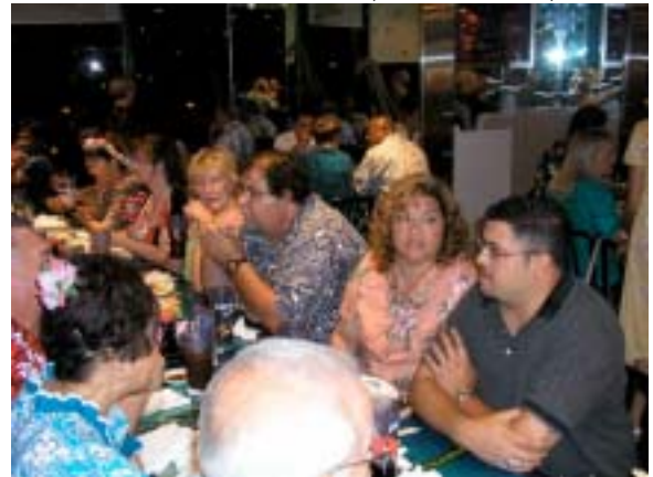
Past Master/Awards Dinner, October 12 th , 2004