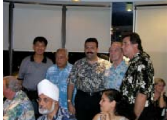
Past Masters, Honolulu Lodge, October 2004