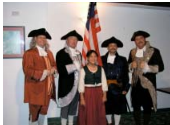
National Sojourners, July 2004