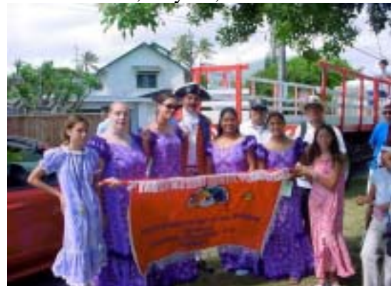
Kailua Parade, July 4 th , 2004