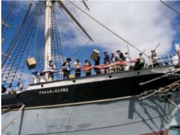
Boston Tea Party, September 11 th , 2004