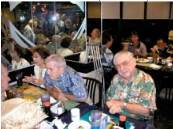
Past Master/Awards Dinner, October 12 th , 2004