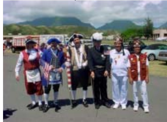
Kailua Parade, July 4 th , 2004