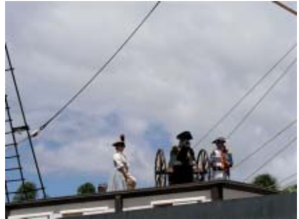
Boston Tea Party, September 11 th , 2004