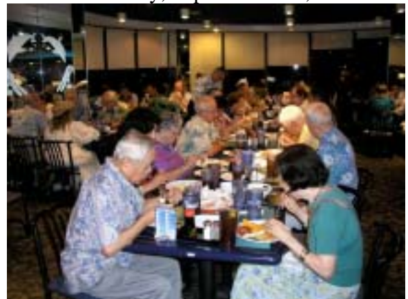
Past Master/Awards Dinner, October 12 th , 2004