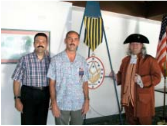
National Sojourners, July 2004