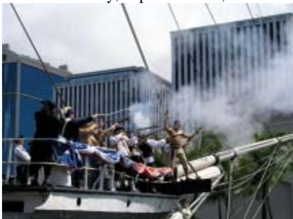
Boston Tea Party, September 11 th , 2004