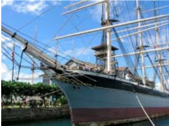
Falls of Clyde, Hawaii Maritime Center

Why: To serve your Lodge and Masonry throughout the State of Hawaii, to build stronger Masonic Ties with our Brothers and to raise money for the Scottish Rite Childhood Language Disorders Clinic