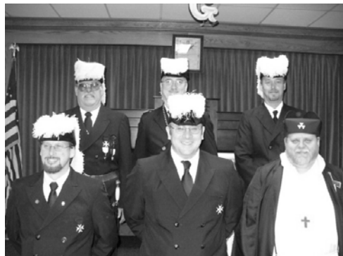
Several members of the Hickory York Rite Ritualistic cast.

The Hickory York Rite held its annual Spring festival in conjunction with the Wilkesboro and Lenoir lodges on Feb 8th and 9th and exemplified the Chapter, Council, and Commandery degrees in full regalia. Congratulations to the 12 new York Rite Masons that participated in the two day ceremony. The Hickory York Rite ritualistic cast did an outstanding performance conducting several of the degrees, culminating in the Order of The Temple (Knights Templar).