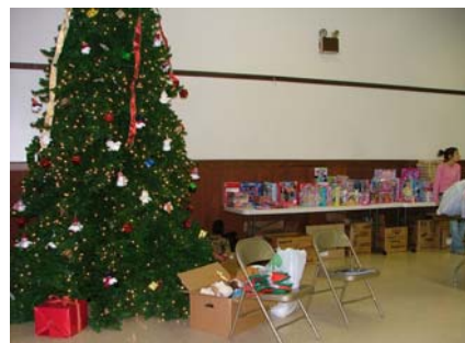
Santa sat right by the LARGE Christmas tree and next to the LONG table, where all of the gifts were kept.