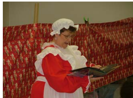
Mrs. Claus enjoying reading a story to the families at the event. Way to go!

Children from the Lorain County area were treated by the Grotto's to a visit from Santa and Mrs. Claus, and a few of their "elves." They also enjoyed receiving gifts, hearing stories from Mrs. Claus and good food from good friends. Below are a few photos taken during the event, taken by our own David Kick.