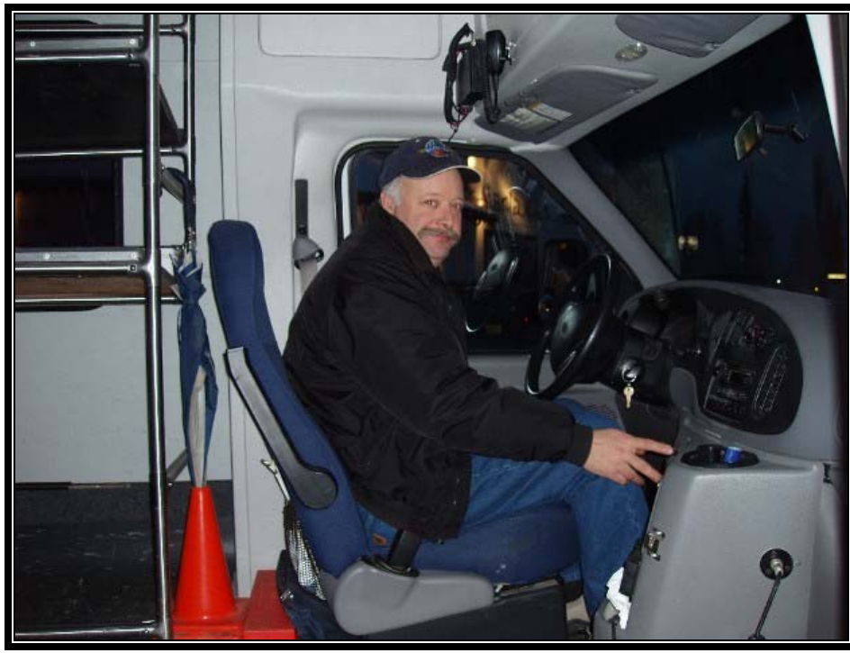
Our Van driver

The Westmark Hotel loaned the Bethel the use of their shuttle van and a driver to take us to North Pole and Santa's house for cookies. We were all so excited to see Mr. and Mrs. Santa especially at this time of the year and wanted Santa to know we had all been good Jobies and to really make sure he knew what was on our Christmas list.