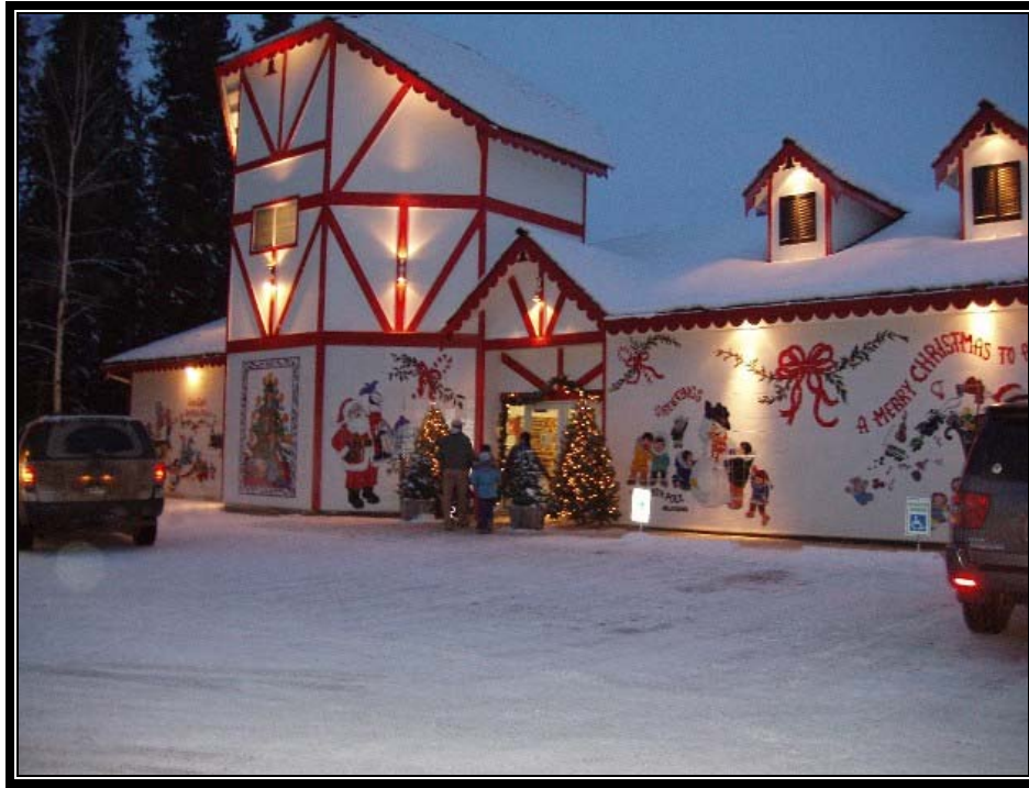
Santa's House in North Pole, AK at 2:00 in the afternoon