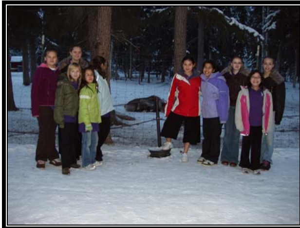
Santa's Reindeer rests before the big day!