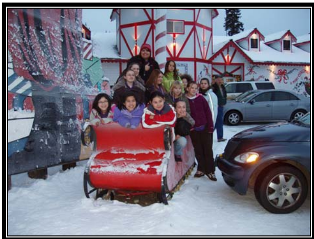
Jobies try out Santa's Sleigh

After a quick stop to try out Santa's sleigh and see his reindeer, it was in to have cookies with Mr. and Mrs. Santa and present him with a Jobie hat. The cookies were YUMMY!!!!