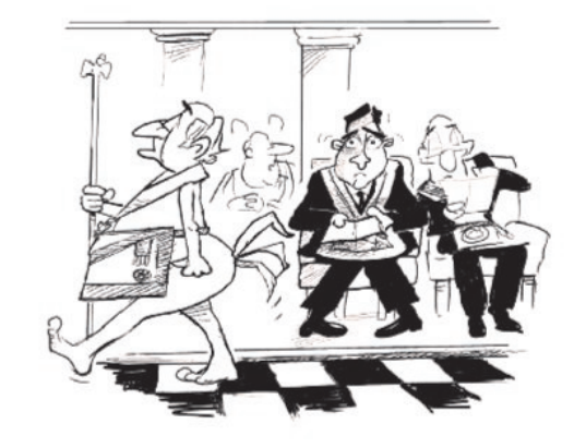
When visiting other lodges it's interesting to see slight variations of the ritual

If you need more information on finding other lodges in the area, visit www.mn-masons.org or contact Bro. Dallas O'Dell for additional information.