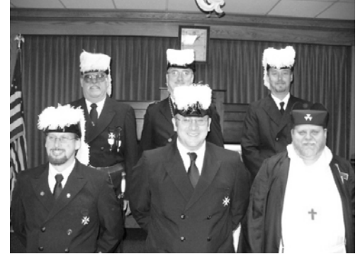
Several members of the Hickory York Rite Ritualistic cast.

The Hickory York Rite held its annual Spring festival in conjunction with the Wilkesboro and Lenoir lodges on Feb 8th and 9th and exemplified the Chapter, Council, and Commandery degrees in full regalia. Congratulations to the 12 new York Rite Masons that participated in the two day ceremony. The Hickory York Rite ritualistic cast did an outstanding performance conducting several of the degrees, culminating in the Order of The Temple (Knights Templar).