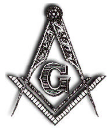
Beverly-Riverside Lodge No. 107

WE'RE ON THE WEB! WWW.MASTERMASON.COM/BEVRIVLODGE 107/