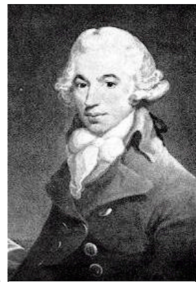
Bro. Ignaz Pleyel

Enjoyed this bit of trivia history? Think you would enjoy more history relating to the craft? The NJ Lodge of Masonic Research and Education may be what your looking for. Check us out at http://njlore1786.org