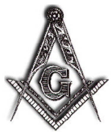
Beverly-Riverside Lodge No. 107

WE'RE ON THE WEB! WWW.MASTERMASON.COM/BEVRIVLODGE107/