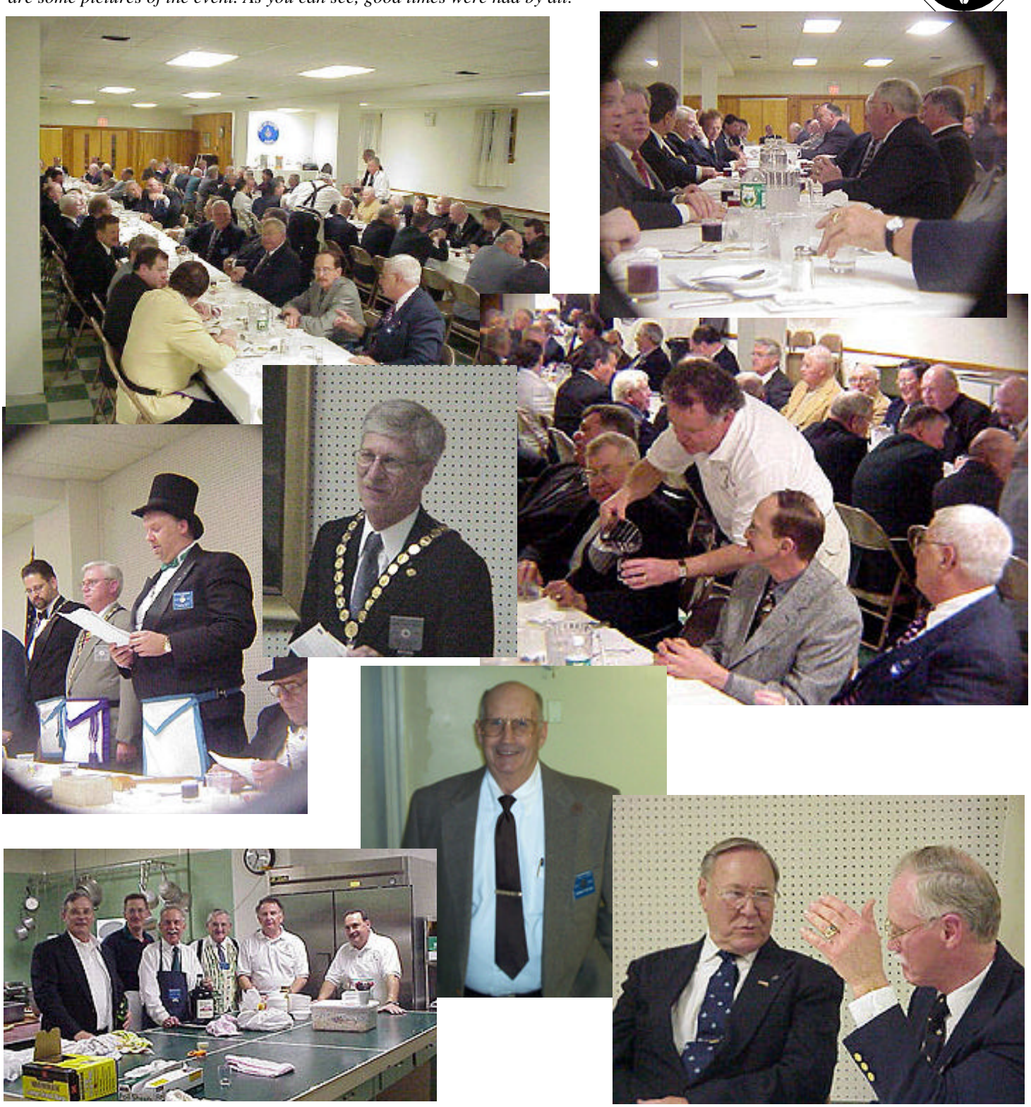
Hopefully this will be the beginning of many more years of Table Lodges between Mt. Holly No. 14 and Beverly-Riverside No. 107. Thanks to all who helped make the evening a big success!

If you did not attend our recent Table Lodge, you missed out on a great evening of good food and fellowship! Here are some pictures of the event. As you can see, good times were had by all!